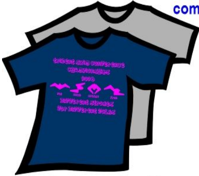
Heather Grey or Navy Blue, Short Sleeve Tee's.

Minimum Team Order must be 24 shirts or more in any combination to take advantage of these Pre-Order Specials