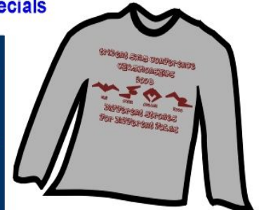
Heather Grey Long Sleeve Tee's.

ONLY Heather Grey Short Sleeve Tee's Available at the Championship Meet in Sizes Youth Large through Adult S-XL for $14.00 each.